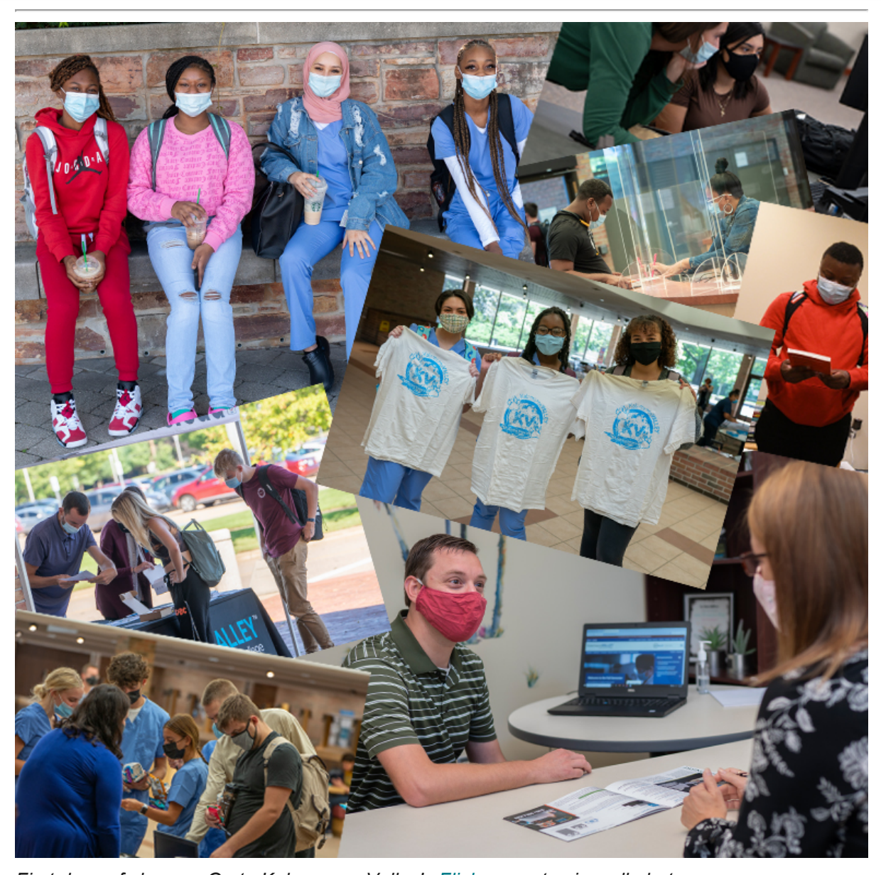
First days of classes. Go to Kalamazoo Valley's Flickr page to view all photos.